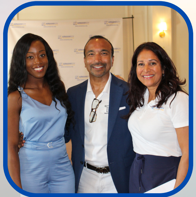
Volunteers of America (COMMUNITY PARTNER)

The Arman Roy Foundation's generosity and dedication truly knows no bounds. All that they have done to support our children—whether through technology, meals or scholarships—is impacting their lives in positive ways that will equip them with the knowledge, confidence and support that they need to break the cycle of poverty.